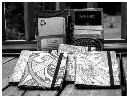
Figure 4: Green Banana Paper products

Green Banana Paper is an example of a model project to promote circular economy concepts in small islands like Guam and others in Micronesia. The company has taken an approach similar to that of OVOP, using locally available resources, the community's creativity, and skills development of village residents to produce quality value-added products. Started in 2016 in the Micronesian island of Kosrae, the company sustainably manufactures world-class vegan products from agricultural banana waste in Kosrae after two years of research. The entrepreneur who started the company, American Matt Simpson, decided to start a company making paper from the fibers of the banana tree—one of Kosrae's only abundant resources besides fish. Green Banana Paper debuted its products in 2016 on the Kickstarter website and at the Festival of Pacific Arts held on Guam. The company produces a variety of products, including wallets made of glue and sustainable paper. (See Figure 4) The money earned goes towards hiring and training employees and buying production tools, such as sewing machines. (18)