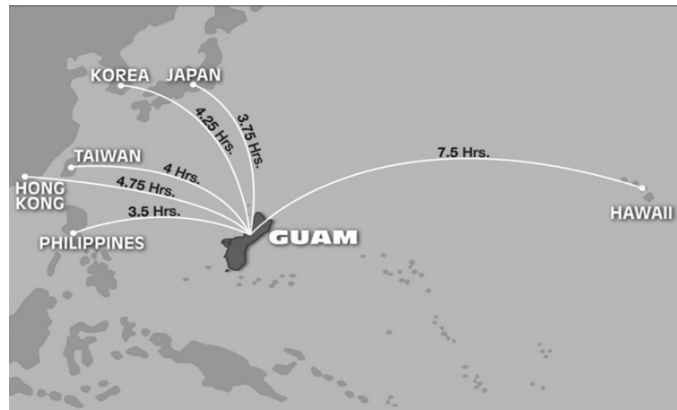
Figure 2: Proximity of Guam along major airline routes

primarily supported by tourism, along with military and government spending. In the fiscal year 2019, Guam received 1.63 million visitors, marking it as the best fiscal year to date for the island's tourism industry. (10) Visitors from South Korea made up 45 % of fiscal 2019 visitors, and 41 % were from Japan. The remaining visitors arrived from the U.S., Taiwan, the Philippines, China, and other areas. (See Figure 2)