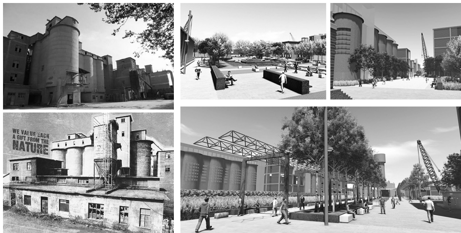
Figure 2: Original workshop and planning map of Dalian 1983 cultural and Creative Industrial Park

Personally speaking, after its update and reconstruction, the Dalian 1983 Cultural and Creative Industrial Park is likely to become the new landmark for cultural innovation and development of Dalian, and a new exemplar for utilization of inventory spaces in Liaoning Province. Therefore, in order that the Dalian 1983 Cultural and Creative Industrial Park can really exhibit its vigor and vitality in future construction and development, updates, reconstructions and brand building from the ecologi-